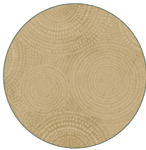
SUGGESTED 108" BACKING "Radiance" 53728W-5 Tan designed by Whistler Studios