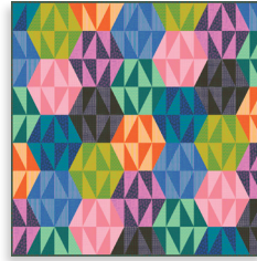
Mood Forever (72" x 72") pattern by Latifah Saafir pattern for sale: shop.latifahsaafirstudios.com

TOTAL ESTIMATED YARDAGE: 4 3/4 BACKING: 4 YARDS OR 108" WIDEBACKING: 1 7/8 YARDS