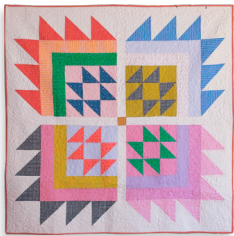
Bear Camp (60" x 60") pattern by Amanda Loewen pattern for sale: prairiequiltco.com

TOTAL ESTIMATED YARDAGE: 8 3/4 BACKING: 4 7/8 YARDS OR 108" WIDEBACKING: 2 1/4 YARDS