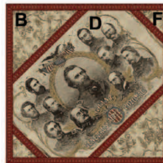
Center Unit 1

Sew a 1 1/2" red border strip to each side of center panel. Center and sew B's and F's to corners. Press and trim to 22 1/2" X 22 1/2"