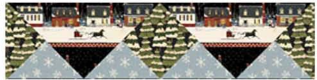
Border 1 Bottom

12. Using 33817-X Multi 4-3/4” squares sew (1) 33819-2 Blue triangles at the short edge to make a new triangles – Make (6).