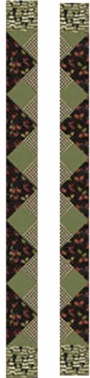
Border 2 Right ↑

To ask questions about this quilt or see more of The Quilted Button Patterns go to: www.thequiltedbutton.com