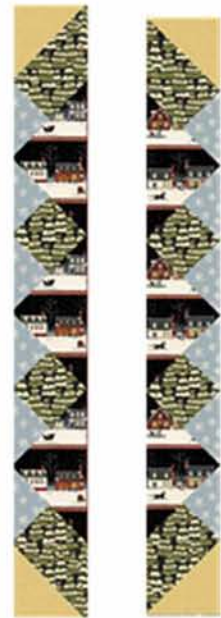
Border 1 Right ↑

16. Sew (1) of the triangles just made in Instructions No. 15 to the right and left of the piece completed in Instruction No. 14 to finish the TOP BORDER at 24-1/2” x 6-1/2”.