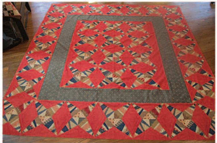
Photo of completed quilt top.