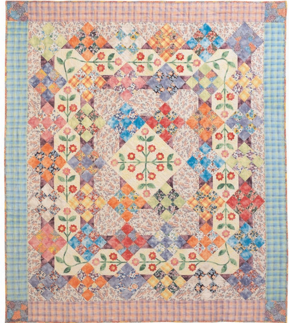
Featuring fabrics from The London Florals collection, c. 1915 by Nancy Gere