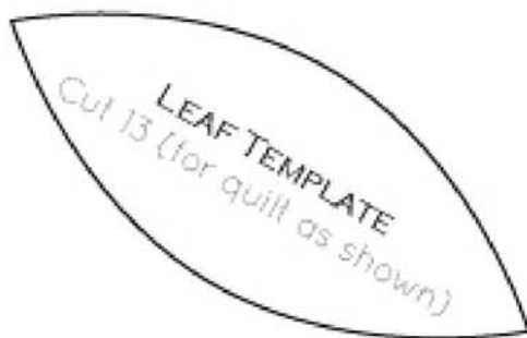
LEAF TEMPLATE Cut 13 (for quilt as shown)