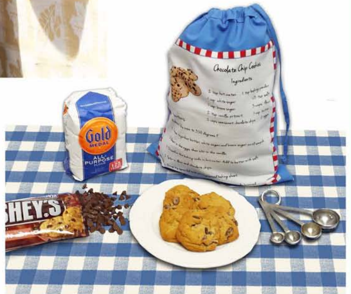
Hostess Recipe Bag

Check www.windhamfabrics.com Free Project section to see if there are any pattern updates before you start your quilt project