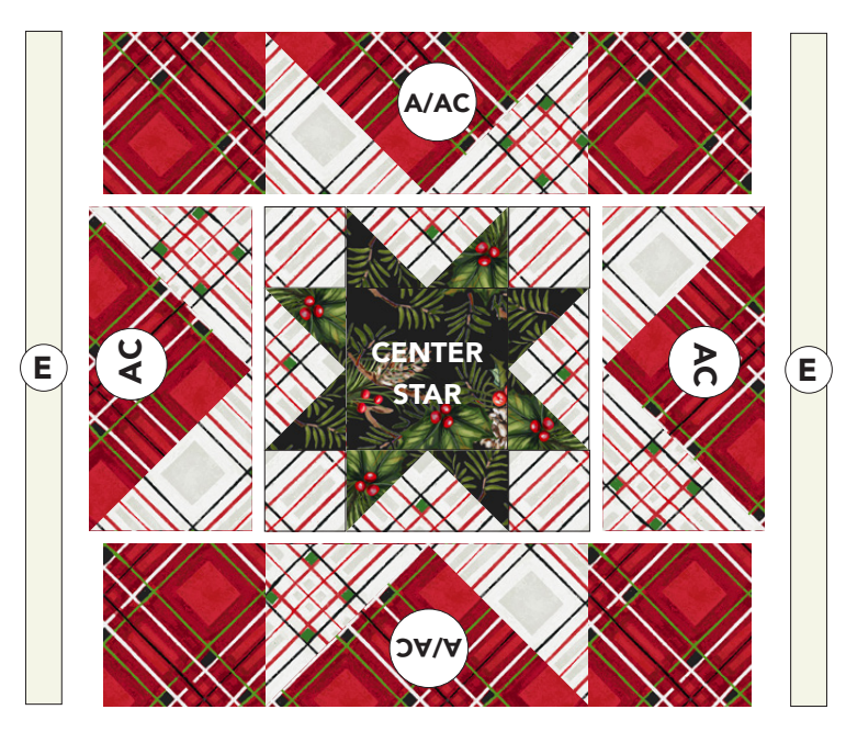
Make (3) Star Blocks

5. Star Block: Sew (1) AC flying geese unit to opposite sides of (1) Center Star unit as shown. Sew (1) A/AC unit to top and bottom. Square block to 8-1/2". Add (1) E 1-1/2" x 8-1/2" sashing strip to each side of block.