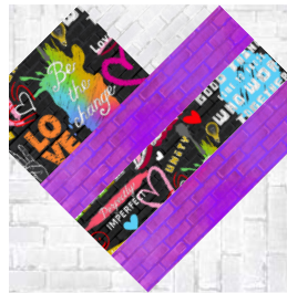
Heart Block 2

Make (10) of each Heart Block. Trim to 16-1/2" square.