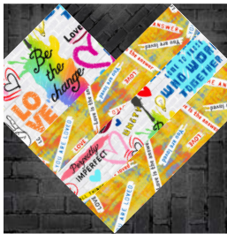
Heart Block 1