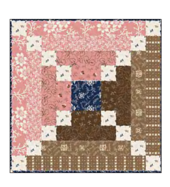
LOG CABIN BLOCK

The quilt center is set on point, so it will be sewn together in diagonal rows using side setting and corner setting triangles from Fabric L . Following diagram on Page 7 for placement and rotation of each block, sew each row in the order stated from left to right.