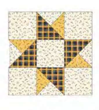
Star block Make 1

5. Sew I 5" x 9-1/2" rectangles to opposite sides of the star block. Sew E 2" x 18-1/2" strips to the top and bottom to finish the pieced placemat top. Make (4).